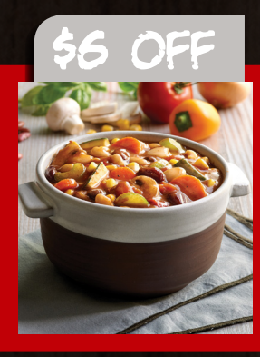
Chipotle Garden Vegetable Chili